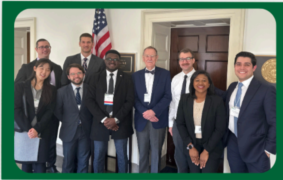
Attendees of 2025 ACP Leadership Day with MO U.S. Representative Wesley Bell.

As we move into the summer months, we hope everyone is able to take some time to rest, recharge, and enjoy a well-earned break. Thank you for all you do to support the mission of ACP and the health of our communities. Warm regards.